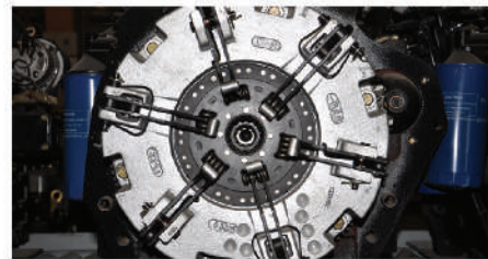
Adopt the heavy 10-inch imported friction plate clutch assembly with good reliability.